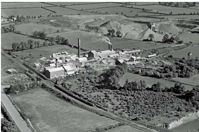
Nelson's works in 1937 - canal bottom left - quarries top right Countrywide Stores (ex corn mill) top left

There was a brief period after the Rugby to Leamington railway opened when the cement was brought from Stockton through Birdingbury by road and then loaded on to trains at 'The Sidings' on the Marton Road but this ceased when the railway from Weedon to Leamington opened in 1895.