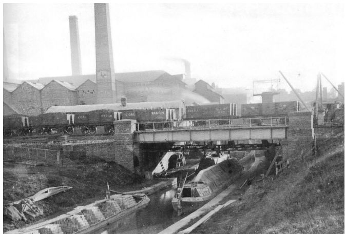
Nelson's works before 1914 with railway bridge crossing the busy canal arm