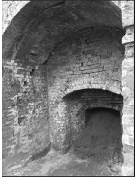
Newly re-excavated lime kiln