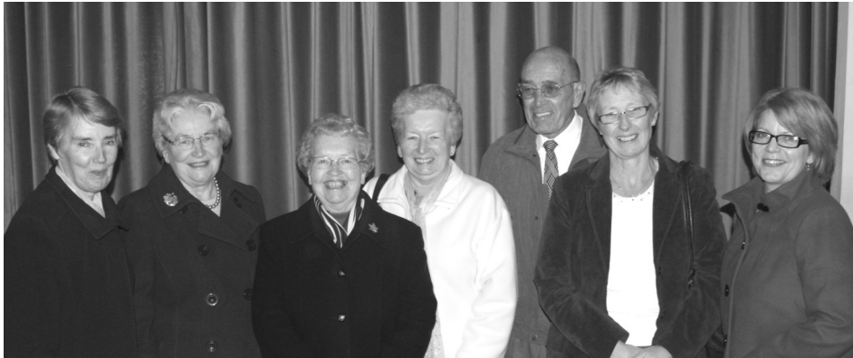
Current and former staff members

Over 100 staff, parents and members of the community joined pupils past and present to celebrate our local infant school reaching 50 years of age in November.