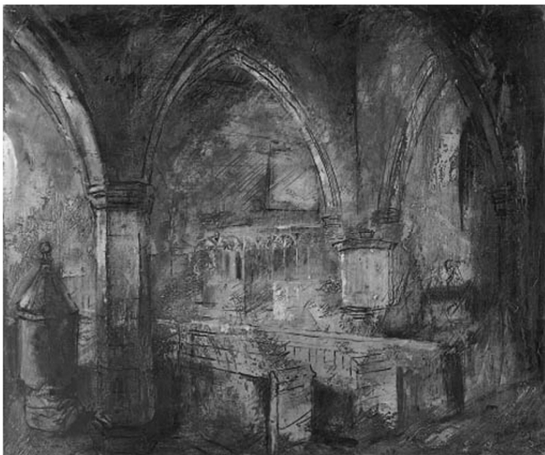
John Piper's picture of the interior of Wolfhamcote Church now in Leamington Art Gallery. This is splendid in colour. To see it, Google 'A Place called Space Leamington Art Gallery re-hang'.