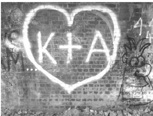
UNDERNEATH THE VIADUCT